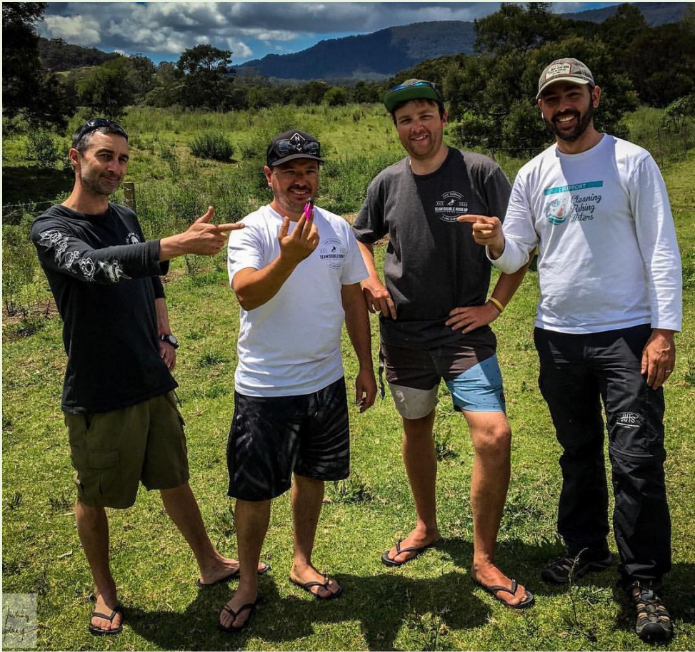
Great event , beautiful location and well organised by Southern Bass with plenty of help from sponsors. Looking forward to next year already!