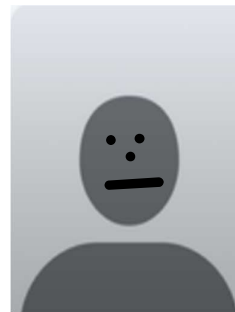
Facebook/ Newsletter Editor