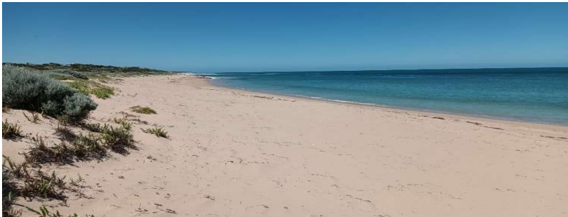
Above - Ocean at Dawesville, Western Australia