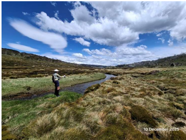
Above - Michael Parkinson, Perisher Creek

The water downstream was a lot better than above, but the results were similar - no fish seen and no fish rising, so worst fears were confirmed. There had been no insects of note on the water upstream but we did notice some midge at our new location about 100m from our starting point. Having no midge patterns, I tied on a Slovenian black caddis pattern and on the first cast through a classic run, a lovely Brown of 30 cms or so came out of the depths and hammered the fly. Go figure!