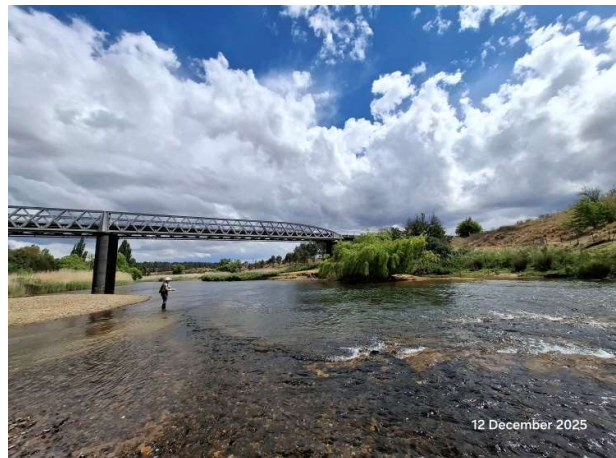
Above - Michael Parkinson, Snowy River, Dalgety

The drive between Jindabyne and Nimmitabel was eye opening. The whole area was brown/ grey, very dry, there was very little ground water to be seen and it appeared very similar to the drought conditions some years ago. The Wullwye was dry, the Bobundra was basically dry between the pools, the MacLaughlin at Nimmitabel was hardly moving and almost dry near the old meat processing plant.