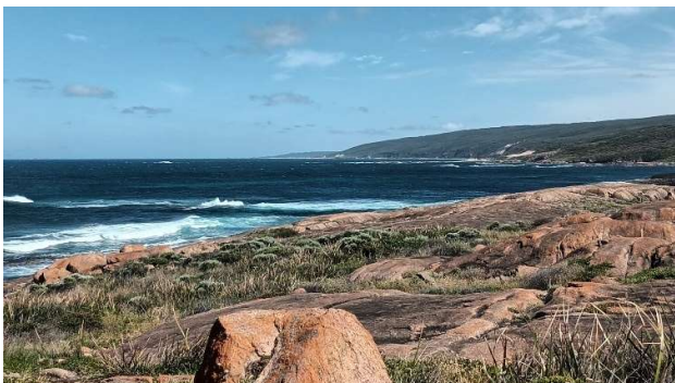
Left - Cape Leeuwin, Western Australia